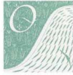
The Overbrook Foundation