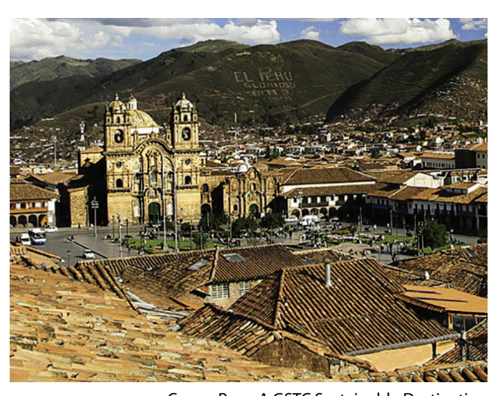
Cusco, Peru: A GSTC Sustainable Destination