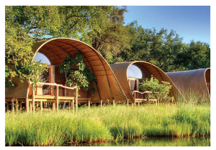
Camp Okuti, The Okavango Delta, Botswana